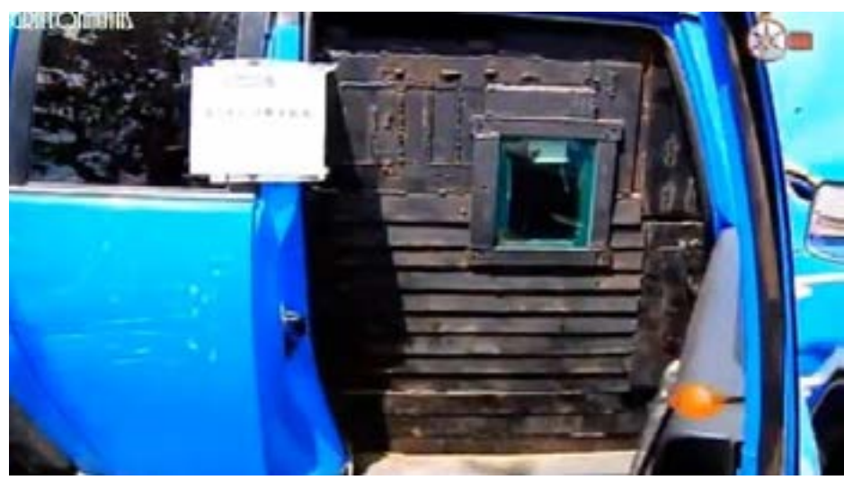
http://www.militaryphotos.net/forums/showthread.php? 156820-Weapons-seized-from-Drug-Cartels-by-Mexico-s-Military-amp-LE-(updates)/page 97