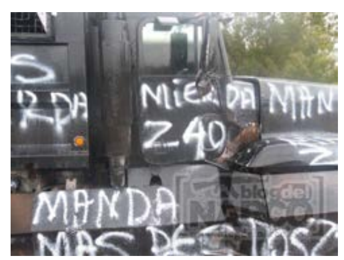
http://www.blogdelnarco.com/2010/07/es- \dots de\_04.html \\ Link is dead.